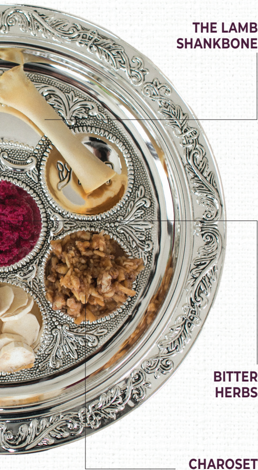
THE LAMB SHANKBONE