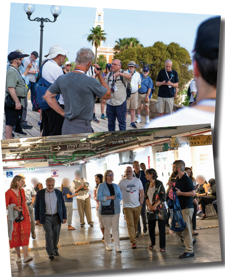
Bottom: Our staff and partners taking refuge in the hotel's bomb shelter.