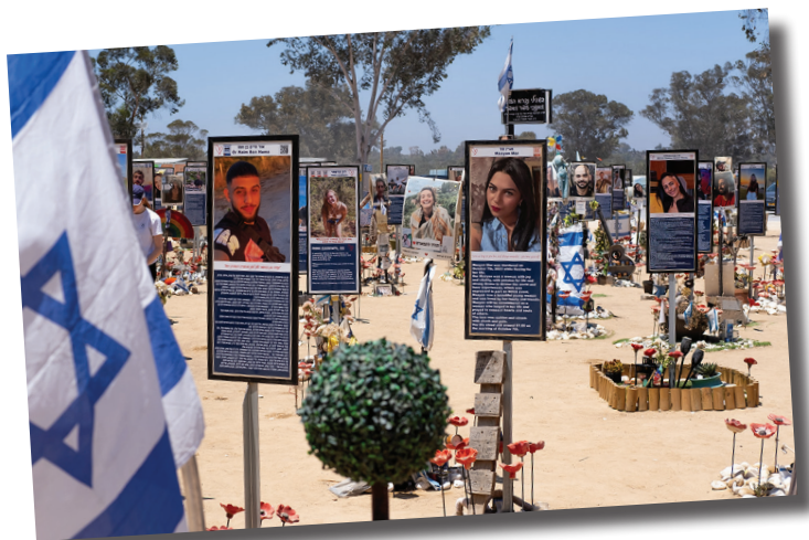
Top: Memorials at the site of the Nova Music Festival, where Hamas terrorists massacred hundreds on October 7, 2023.

Iran regularly fired missiles, which drove us to visit the bomb shelters. For days we heard the blasting sirens at least twice a night and sometimes during the day.