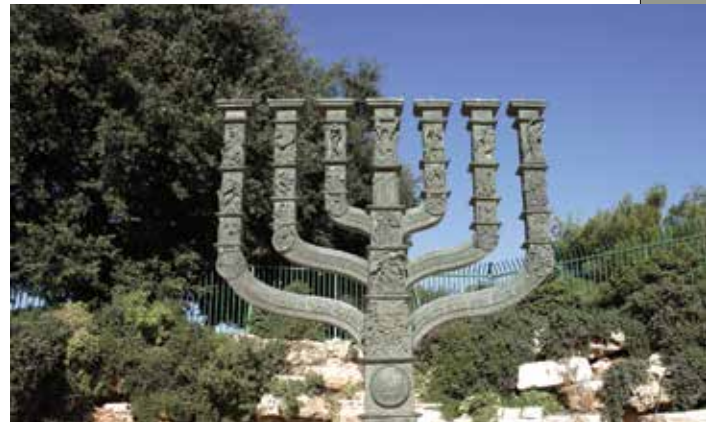
The menorah outside the Israeli Knesset building

Micah's words, remembered for their shocking severity by Jeremiah, deserve to be taken seriously by each generation of God's people. Even today, religious and civil leaders in Israel and around the world still attempt to misuse their positions of leadership for their own glory and profit. The words of the prophet are a dire warning against the complacency that can reject God's standards and values. Micah's prophecies are a passionate plea for consistency between one's beliefs and one's actions. The Lord is content with nothing less.