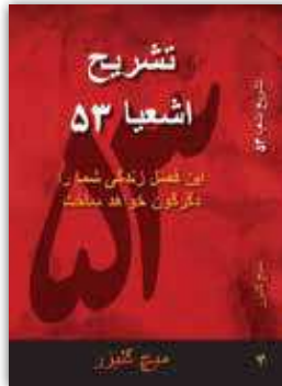
Isaiah 53 Explained in Farsi, the language of Iran

The question we naturally want to ask is this: "Is the current conflict between Israel and Iran a reflection of the spiritual battle between God and the devil as we draw closer to the end of this age?" It certainly seems so! Both Ephesians 6 and Daniel 10 pull back the curtains of heaven to show us that this earthly war reflects heavenly realities. The nations of the world, inspired by Satan himself, seek the destruction of God's chosen people in order to put a stop to the plan of God for the end of the age (Romans 11:11-19). This would elevate the Middle East conflict beyond the political and into the spiritual realm!