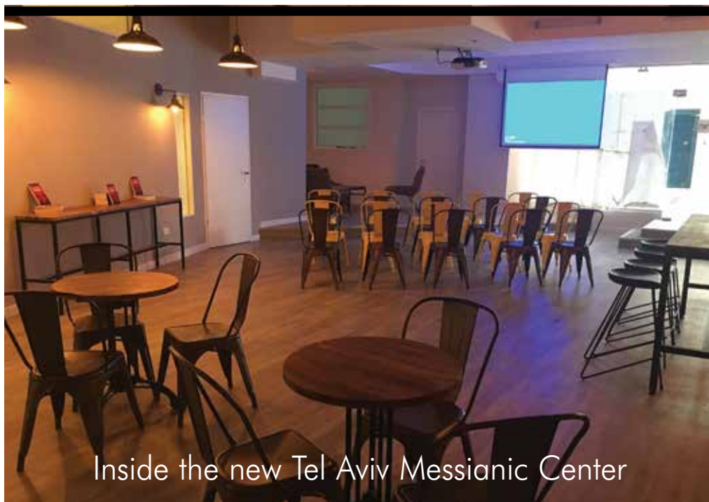
Inside the new Tel Aviv Messianic Center