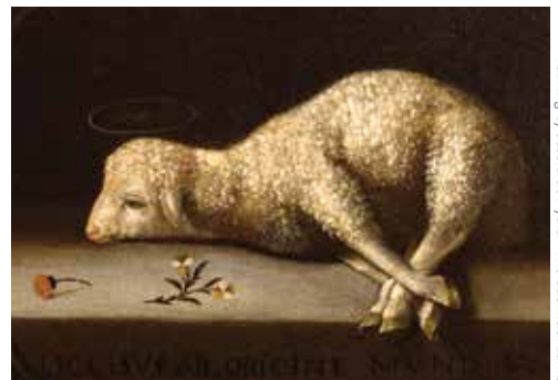
Painting by Joséfa de Ayala - The Sacrificial Lamb

The theme of the sacrificial lamb continues through Scripture, but can only be fully appreciated by first understanding the original Passover. By retelling the Passover story during the Seder, we deepen our connection to both the people and the God of Israel as we understand that the ultimate sacrificial Lamb is Jesus Himself.