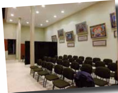
Meeting room in the Messianic Center in Buenos Aires