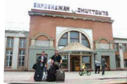
Ministry to Bukharan Jews - continued from page 4

It is our vision to establish a Messianic Center in Birobidzhan that would be a place of ministry to disabled, disadvantaged and homeless Jewish people, as well as a worship center for Jewish believers in Yeshua. We ask you to please pray for the ongoing ministry in Birobidzhan and the rest of the region.”